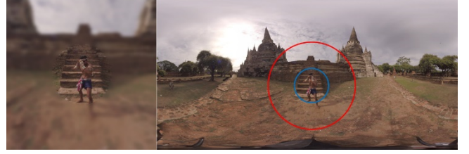
Figure 3: On the left: Resulting foveated rendering effect. On the right: Comparison between total size of the frame against viewport size in red, and size of the cropped section of the foveated rendering system in blue.

When the client receives back the response from the server with the high-resolution and low-resolution frames, before projecting it onto the sphere, it fuses both frames using a fragment shader that assigns the value of the pixel in the high-resolution texture if it belongs to the foveal area, otherwise it sets the value of the pixel in the low-resolution texture. An illustration of the result is shown in Figure 3.